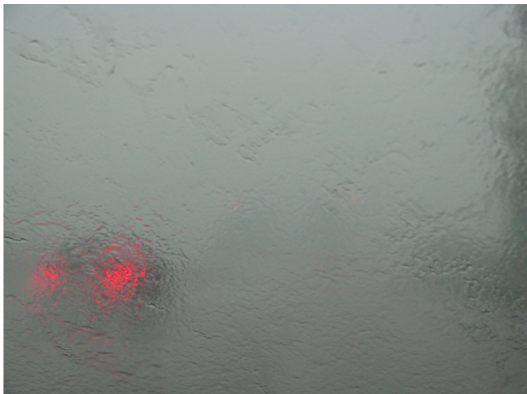
“View through the Windshield – PANIC” by Jacqueline Vignone