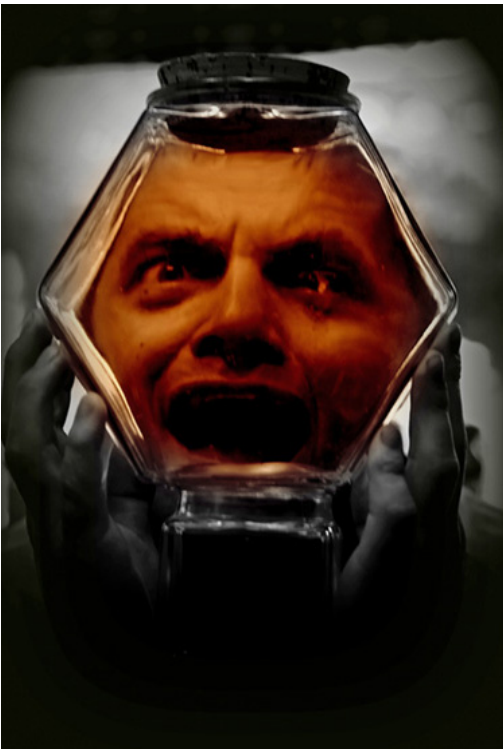
“Twilight Zone, Eternally Trapped – Terror ” by Isabel Thiel